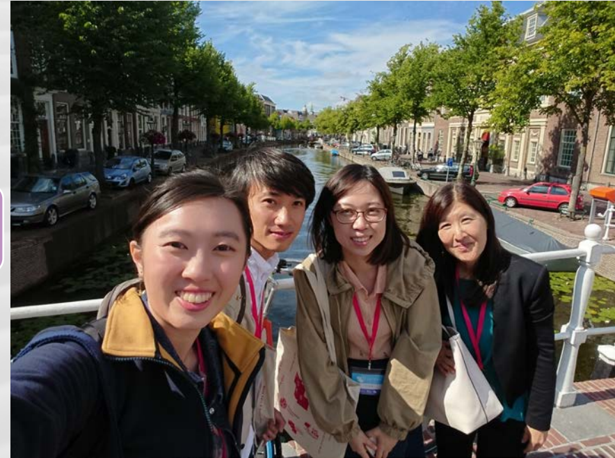
International Convention of Asian Scholars in Leiden, Netherlands